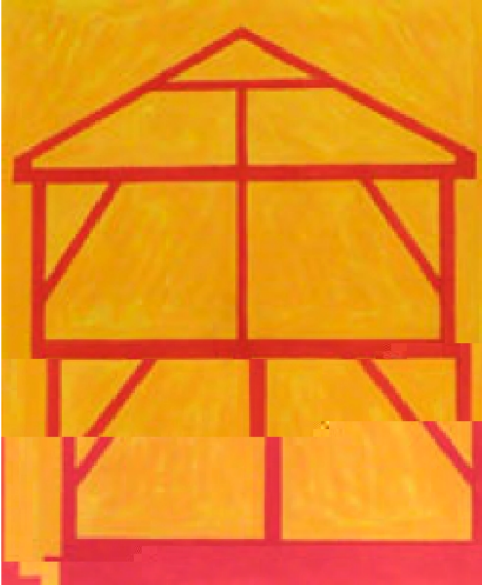
An American Frame, watercolor