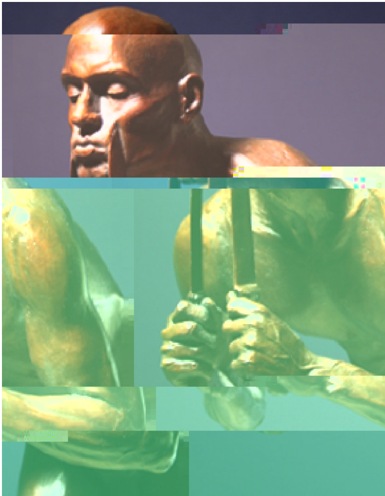
Honey Kiss, Vinegar bronze and stone