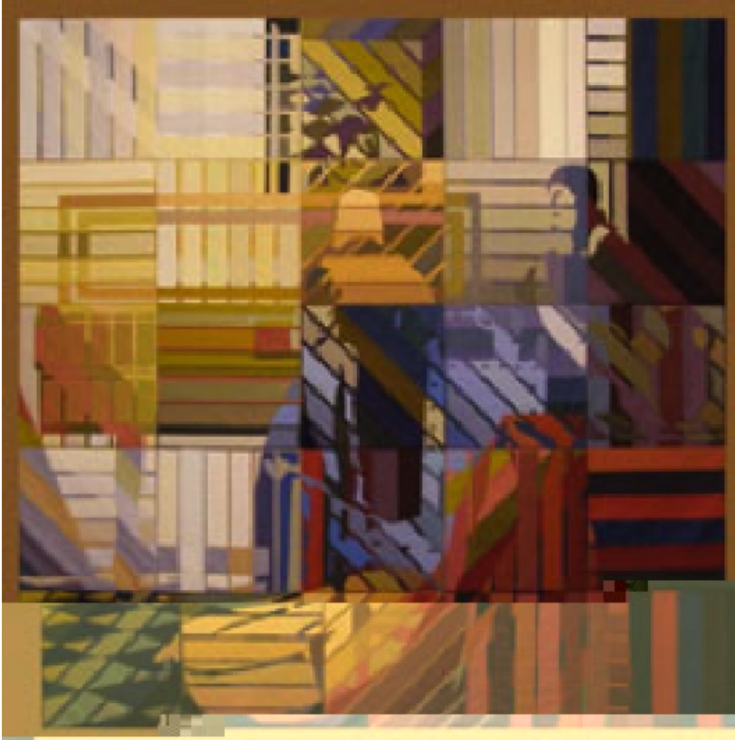
Self-Reflection, pieced, appliquéd cotton